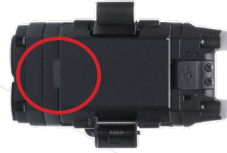
Tab not aligned with notch

Press battery into the FACT Duty housing and secure both latches (one on each side). FACT Duty will start recording once the battery makes contact.