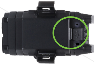
Tab aligned with notch